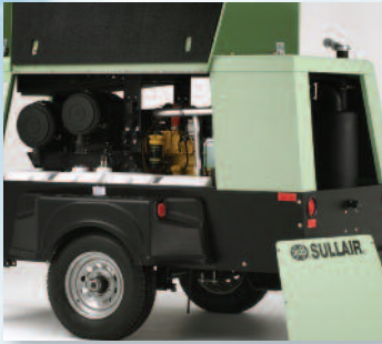
Total Accessibility Routine maintenance is simplified.